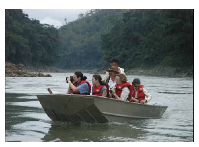
A Portion of The Group on Their Way to Piedras Negras

like we were parting from close friends at the end of the week." perts you put together to lead us and teach us about their disciplines."