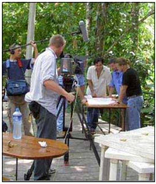
Filming in Restaurant Don Mucho, El Panchan

advice throughout the production, from historical facts down to costuming. The film crew worked tirelessly, and MEC was happy for the chance to share our discoveries with a wide international audience.