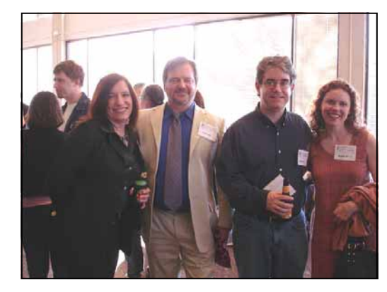
The Stuarts and Taubes at the Maya Meetings

mul Biosphere Preserve of Campeche, Mexico. The latest pottery found at sites dominated by Calakmul display a surprising variety of individual styles. Greater artistic freedom went hand in hand with political independence, according to Dr. Grube.