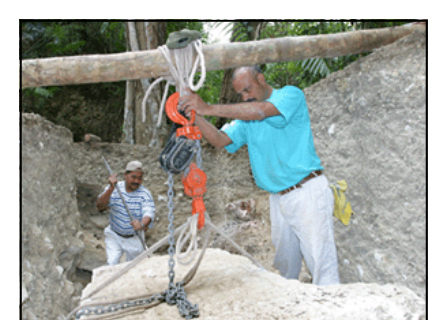
Stela 40 lifted from an excavation

of the bellicose times as well as the important role of women in warfare. K'inich Balam's decision to marry the warrior princess was ill-fated. During the reign of K'inich Balam's son, Tikal exacted