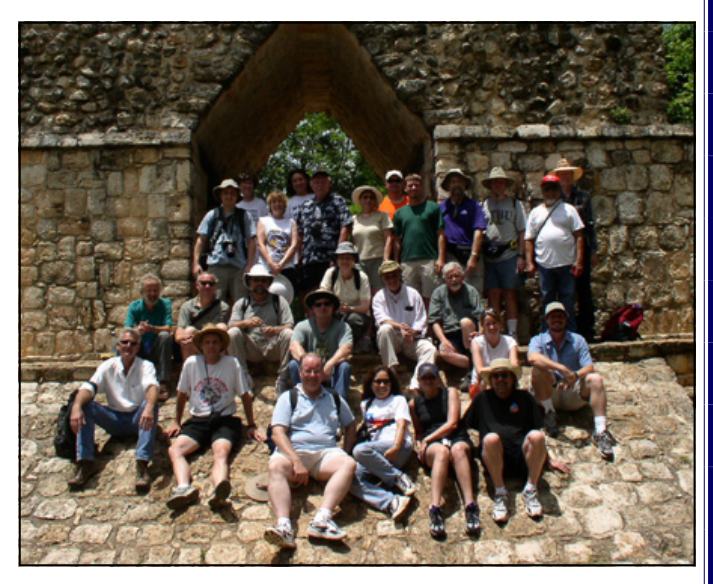
Maya Mathematics Group under Ek Balam's entry arch

inside story of Ek Balam's excavations and spoke intimately about the history of his people.